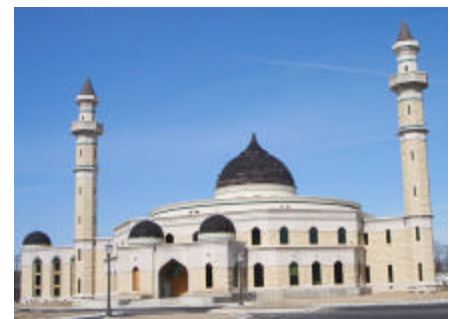
New Mosque in Dearborn, Michigan