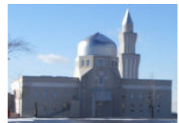
New Mosque in a Muslim subdivision of Toronto, Canada