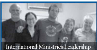
International Ministries Leadership

"And this gospel of the kingdom shall be preached in the whole world for a witness to all the nations, and then the end shall come" (Matt. 24:14, NASB).