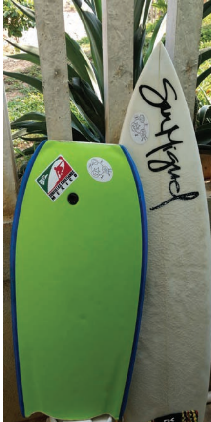
Spotted on surfboards, these 3 Circles stickers can trigger an opportunity to share the good news in between catching waves.