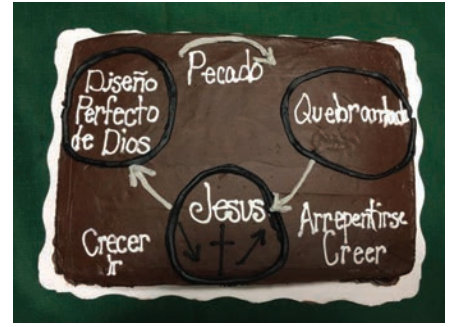
What better way to celebrate a birthday than with a cake that tells the most important story of all – and in Spanish, too!