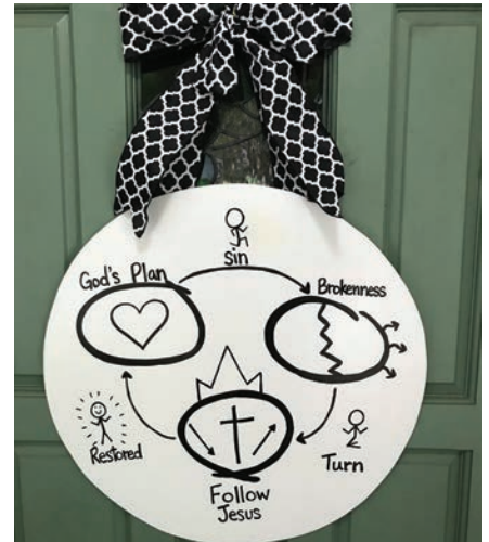
A creative door hanger greets everyone with the gospel even before walking into this home.