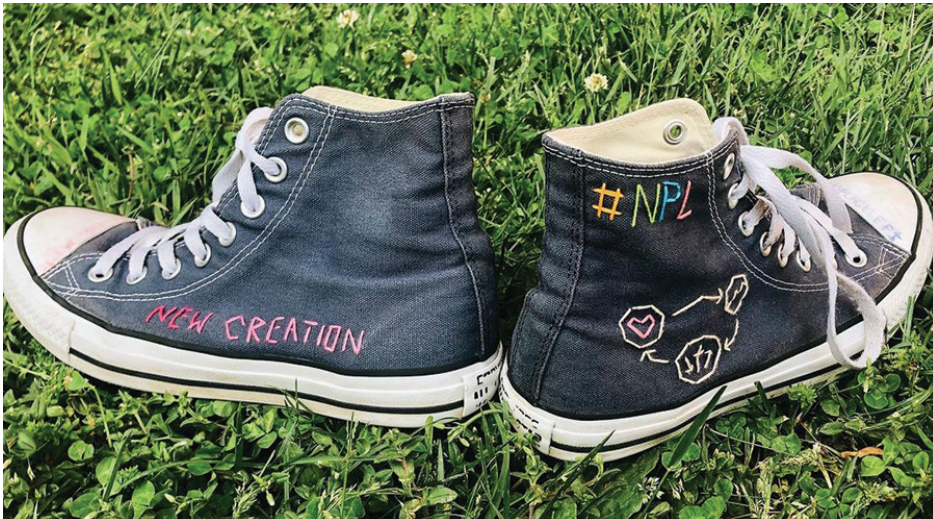
Embroidered with the gospel message, these cool kicks are the definition of having feet fit with the readiness that comes from the gospel of peace (Ephesians 6:15).