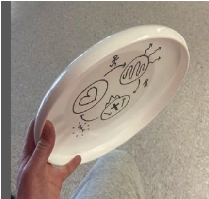
A casual game can turn into a unique moment of outreach when a frisbee is upcycled with a drawing of the 3 Circles.