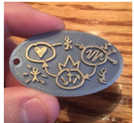
With a 3D printed design of the 3 Circles, this keychain serves as a conversation starter wherever you go.