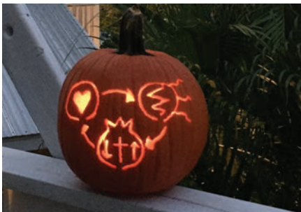
A Jack-O-Lantern masterpiece like this one is sure to spark gospel opportunities with neighbors.